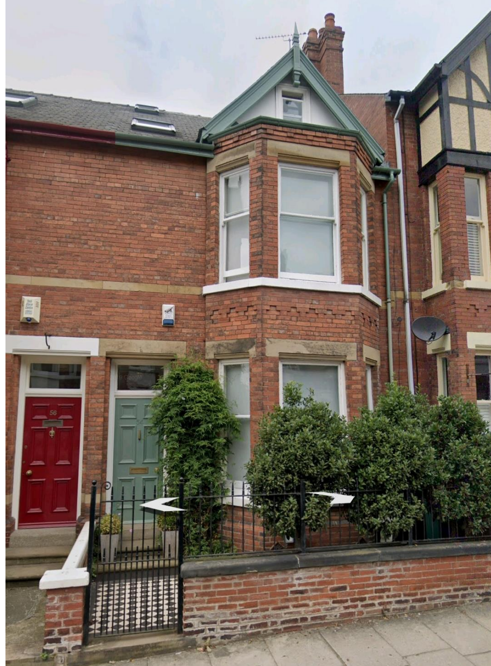
Area Planning Sub Committee Meeting - 10 December 2020

Front elevation